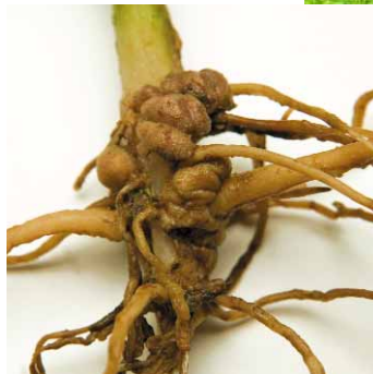
Nitrogen fixing Nodules on Lupin plant ▶

New Edge Microbials use only the most productive NSW-DPI approved strains. Slattery & Pearce (ACIAR Proceedings 109c, 2002) demonstrated that these strains significantly improve crop yield even when background soil populations of wild rhizobia were present.